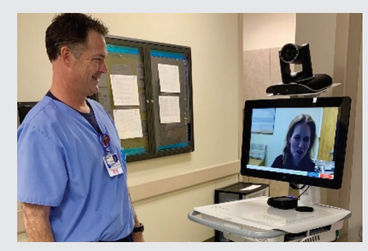
ED physician having a psychiatry consult via an American Well cart.

AltaPointe provides partnering hospitals with American Well telemedicine carts, which gives them on-demand access to AltaPointe's psychiatry network